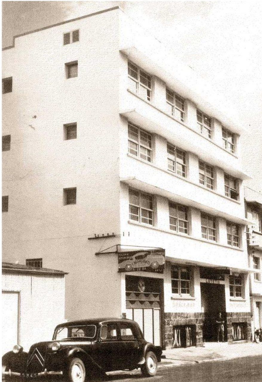
Hotel Lutétia